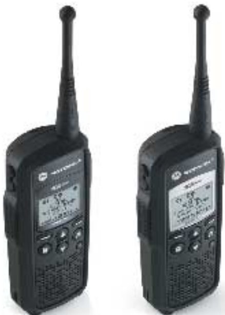
DTR550 and DTR650 Radios

It all adds up to a superb combination of features for your convenience, management, and productivity, all at an extraordinary value.