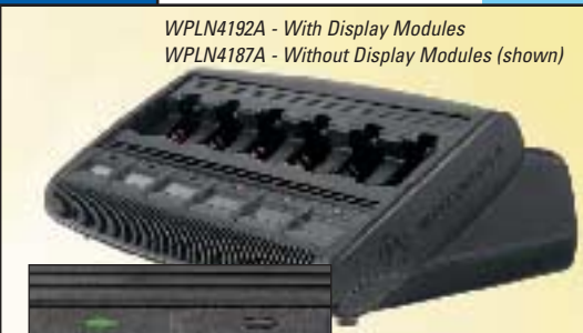
WPLN4192A - With Display Modules WPLN4187A - Without Display Modules (shown)

RLN5382A - Individual IMPRES Display Module for WPLN4108BR (Software Version 1.3 or later)