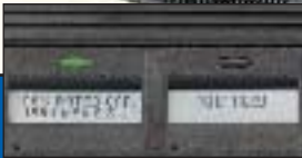
Display shows battery capacity, voltage, charge status and more in real time.