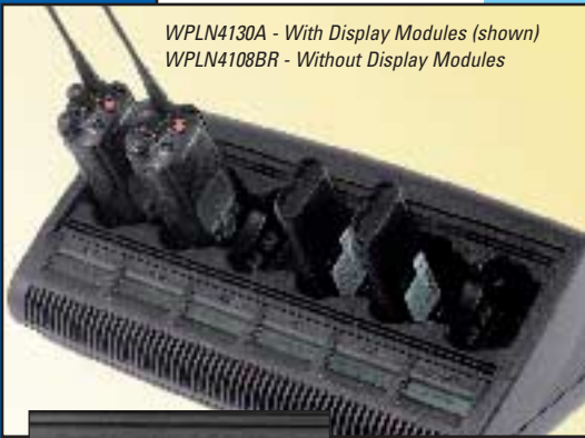
WPLN4130A - With Display Modules (shown) WPLN4108BR - Without Display Modules