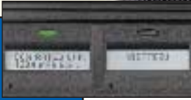
Display shows battery capacity, voltage, charge status and more in real time.